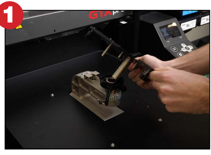
Step 1: Insert the T-Lock Base into the platen stem of the Brother DTG printer.

Below are instructions for installing the T-Lock Shoe Inserts on your T-Lock Platen Base.