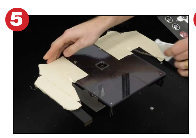
Step 5: Apply double sided tape needed for securing shoes.