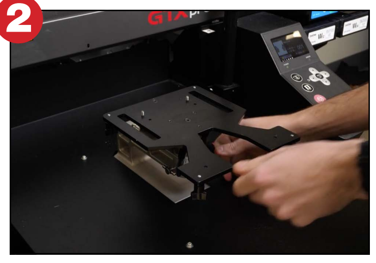
Step 2: Adjust the height of the platen and tighten the locking lever.