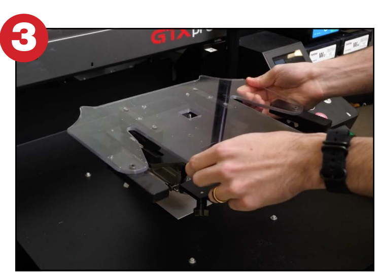
Step 3: Insert the T-Lock Shoe Insert into the T-Lock Base.